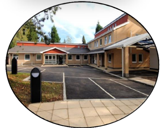
Sunrise Centre – Southborough 6 Bedded Unit