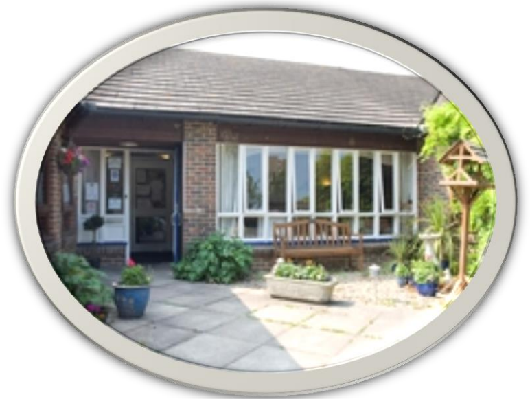
The Birches, Tonbridge 3 Bedded Unit