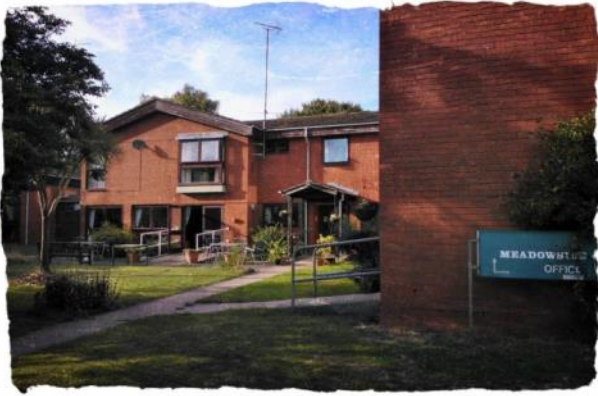
Meadowside – Walmer 22 Bedded Unit