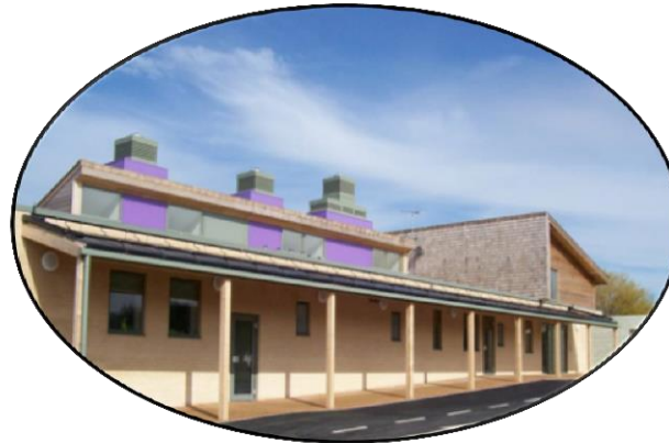
Windchimes – Herne Bay 6 Bedded Unit Jointly funded by KCC and Health Authority