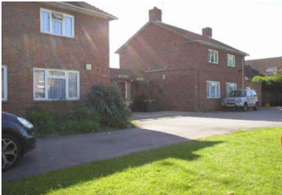
Hedgerows Staplehurst 5 Bedded Unit