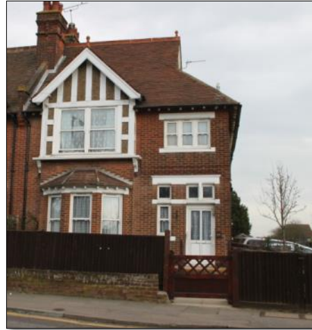
Canterbury ASU – Canterbury 5 Bedded Unit