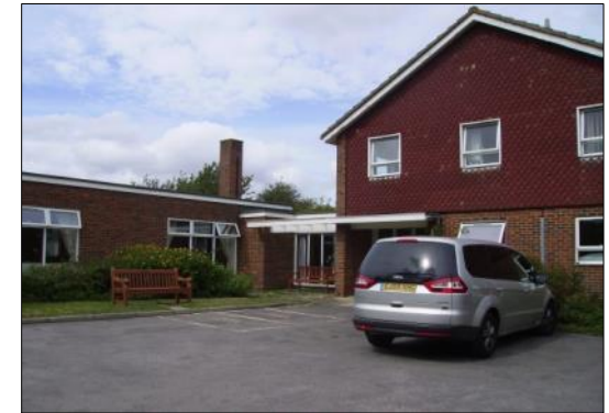
Southfields – Ashford 15 Bedded Unit