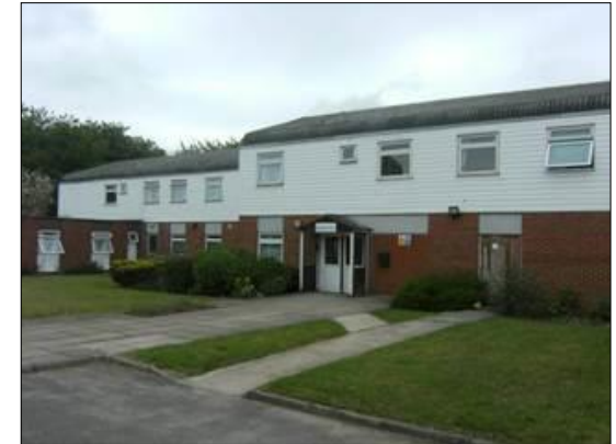
Osborne Court – Faversham 13 Bedded Unit