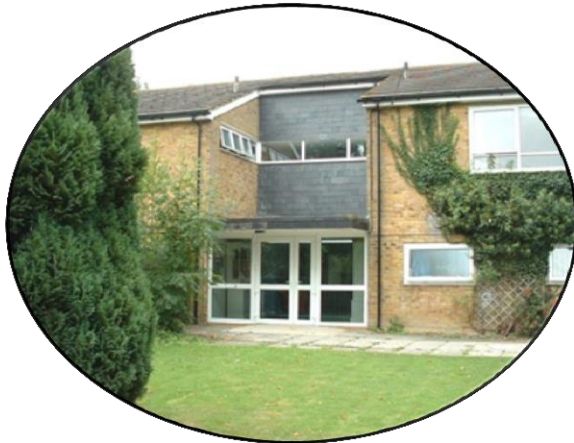
Fairlawns – Ashford 7 Bedded Unit