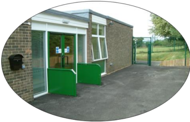
Bluebells – Maidstone 4 Bedded Unit