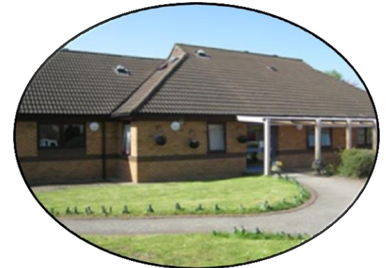
Treetops – Dartford 6 Bedded Unit