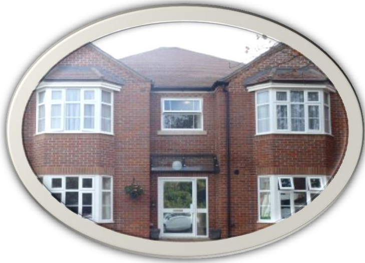
Rusthall Respite, Tunbridge Wells 5 Bedded Unit